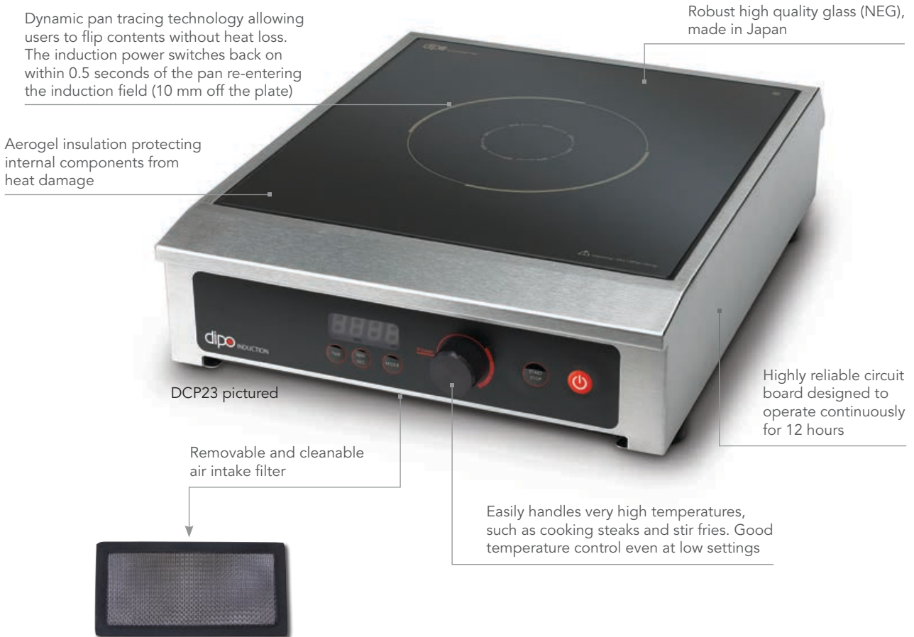
Fast response to controls*

Dipo Induction ranges are made in Korea where the company is solely focused on producing high quality induction machines, designed and manufactured to deliver the highest standards of performance and reliability. They are the market-leader in Korea and many other countries.