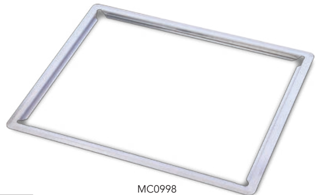
MC0998 Stainless steel trim ring pictured