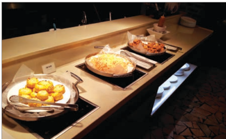
Multiple DWR04's installed with stainless steel trim in buffet counter