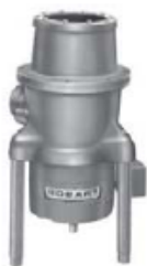
Standard with Long Upper Housing