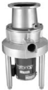
Shown with Long Housing